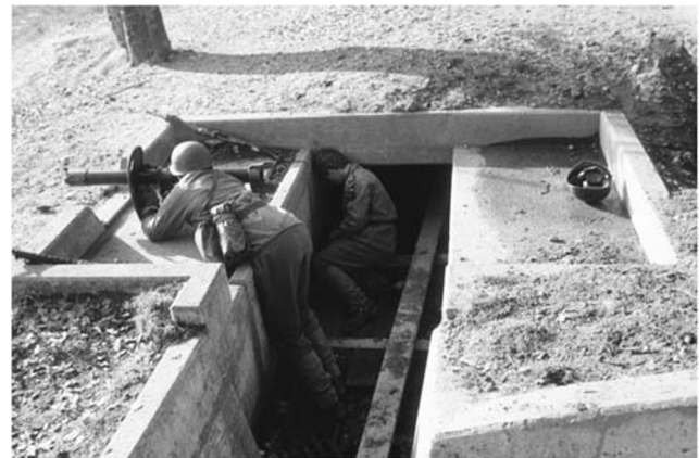
Fig. 4 Positions of the shooter and loader during a firing exercise with an 83-mm rocket tube 80

The injuries were seen as consequences of pressure development or of the extremely fast gas jet; therefore, a technical examination was carried out: On the occasion of a series of tests carried out by the Ballistic Lab of the Ministry of