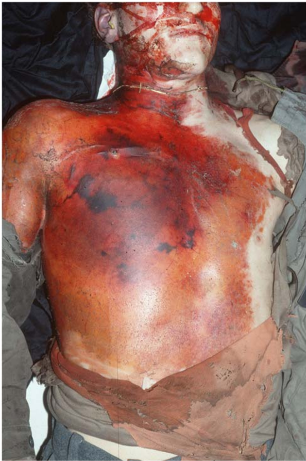
Fig. 5 Case 2: Third degree burns resulting from the jet blast

Defence in Thun, Switzerland, a massive pressure effect in the area of the propulsion jet of the rocket behind the weapon could be shown. The results of the forensic medicine could be easily reconciled with such a pressure effect. It was quite conceivable that the channel-shaped defect could have even occurred without a projectile as the area was small and the pressure was high. It was remarkable that the canal was not