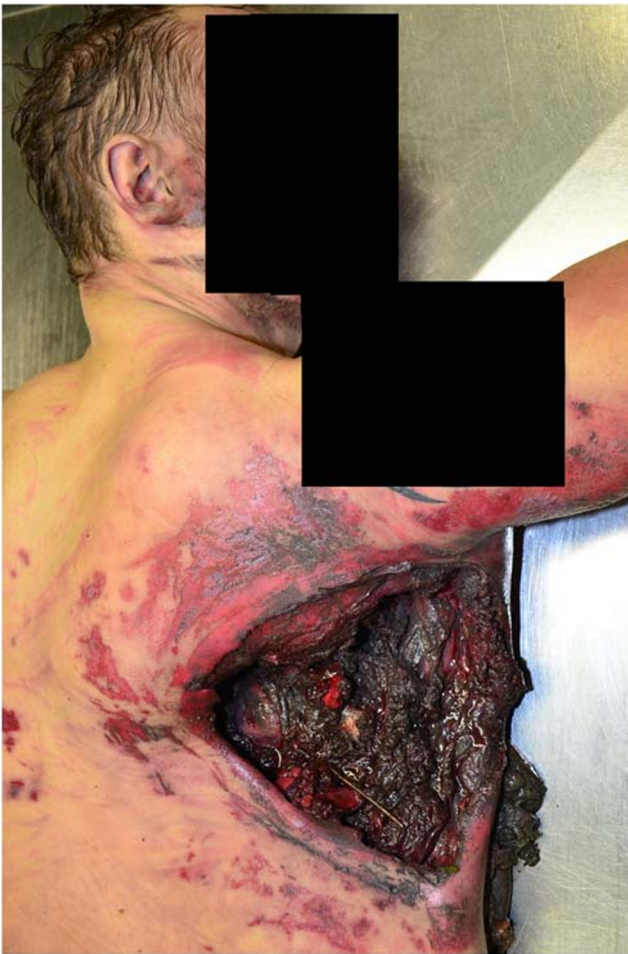
Fig. 2 Case 1: Injury on the back of the right side of the body; reaching up to the right arm