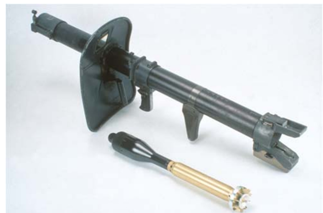
Fig. 8 The Swiss Army 83-mm rocket tube 80

In 2007, a comparable casuistry to the second case presented was published: A 26-year-old man suffered from injury by a propulsion jet of a rocket on his right thigh due to an RPG-7. The patient had already suffered “significant blood loss” in the field and tried to control the bleeding with a tourniquet but was unsuccessful. Upon arrival of the care team, the patient had a Glasgow Coma score of 14, a systolic blood pressure of