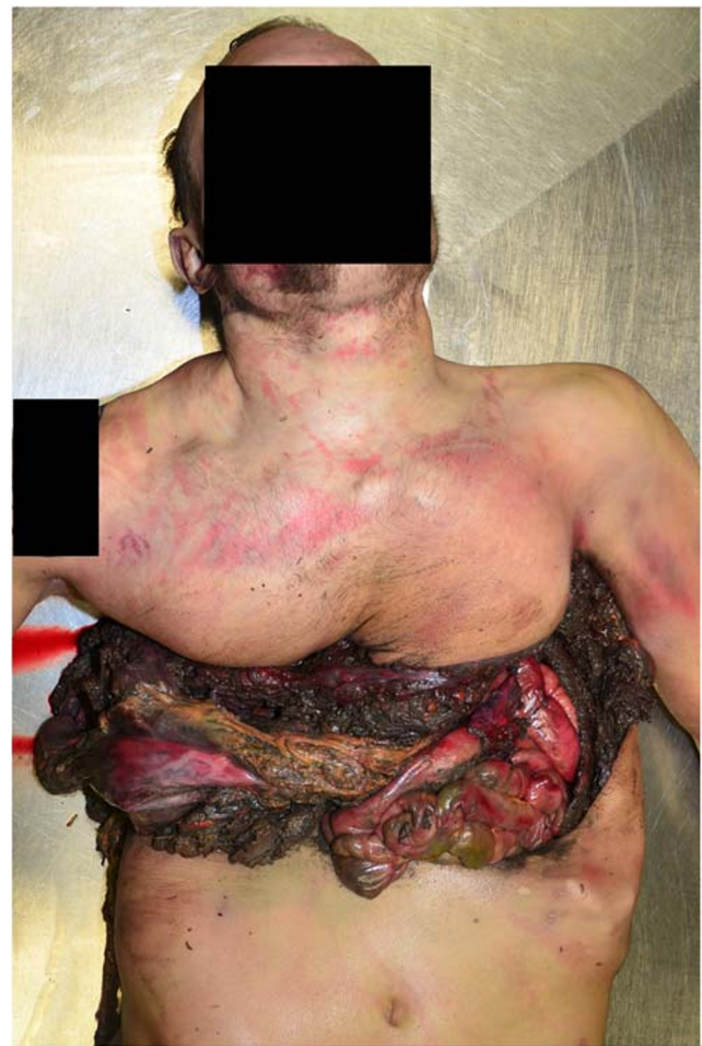
Fig. 1 Case 1: Injuries at diaphragmatic level at the front of the body

In the thoracic cavity were found deposits of a gray, metallic, powdery material consisting of bright plastic spheres and textile ribbons pressed together to form slabs (Fig. 3). The heart had been torn open on its left side, the walls of the atrium and the atrium itself were nearly completely destroyed, and