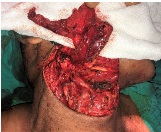
Fig. 3 Modified SPAF harvested

medial border of the opposite anterior belly of the digastric muscle. The mylohyoid muscle can be raised partially or completely, depending on the bulk of the flap required for reconstruction (Fig. 2). The platysma muscle was also raised depending upon the size of the surgical defect. The inferior neck skin flap was also raised in a supraplatysmal plane and the platysma muscle was cut inferiorly, the maximum limit being at the level of the second transverse neck skin crease (Fig. 3). The remaining inferior neck skin flap was raised in a subplatysmal plane.