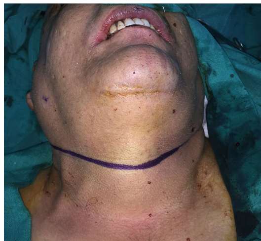
Fig. 1 Incision marking

We then approached from the contralateral anterior belly of the digastric muscle, dissecting the fascia off the muscle and raised the submental fat along with the platysma muscle, incorporating the ipsilateral anterior belly of the digastric into the flap. The mylohyoid muscle was mostly cut at the