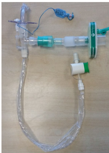
Fig. 2 Example of system to initiate cuff deflation during ventilator support weaning

Once the cuff is deflated, the usual clinical assessment of upper airway patency can be performed through a brief digital occlusion of the tracheostomy tube. Swallowing should be assessed by a speech and language therapist due to the high risk of silent aspiration and the need to identify rehabilitative strategies to promote airway protection. Instrumental assessments routinely performed such as fiberoptic nasolaryngoscopy and fiberoptic endoscopic evaluation of swallowing assessments are considered non-mandatory due