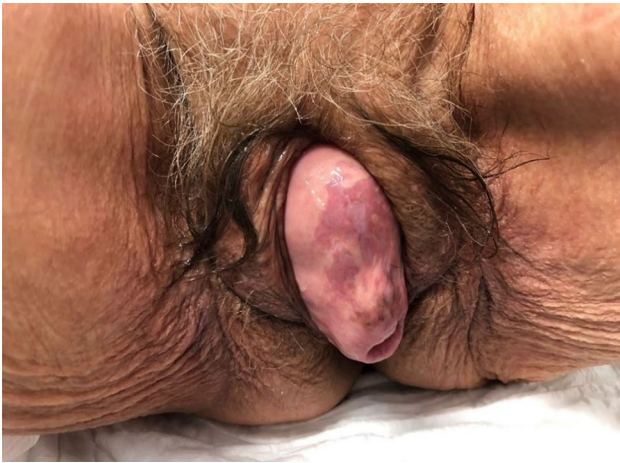
Fig. 1 Grade IV anterior and middle compartment prolapse with superficial ulceration of areas of the vaginal mucosa of patient 1