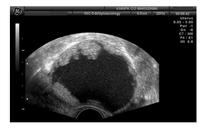
Fig. 4 The characteristic ultrasonographic image of serous borderline tumor with typical endophytic outgrowth without free peritoneal fluid

Clinically, the diagnostic challenge is not the differentiation between malignant and benign but rather that between borderline and malignant tumors. Sensitivity of intraoperative examination in the diagnosis of borderline tumors is 60-71 % [4, 23, 24]. Thus, it seems warranted to search for criteria, by applying the available methods that would be useful in the preoperative evaluation and diagnosis. One such approach is ultrasonographic examination of morphological tumor features combined with evaluation of selected clinical parameters, which is feasible in most centers providing programs of surgical treatment of ovarian cancer.