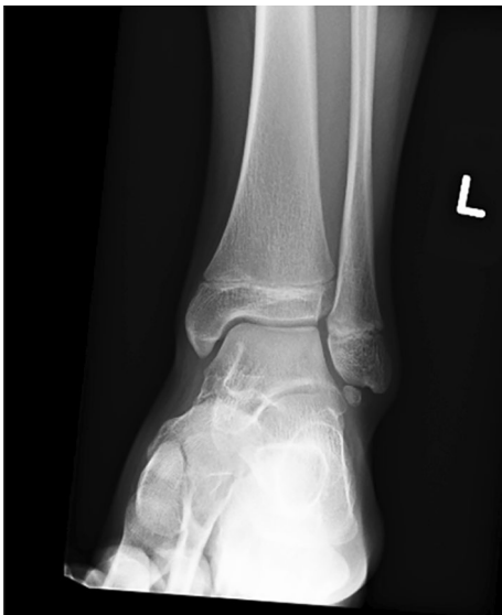
Fig. 2 Ankle radiograph with os subfibulare