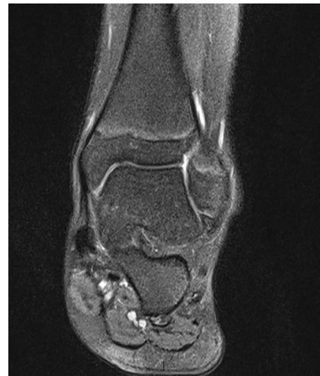
Fig. 3 MRI scan of the ankle with os subfibulare-ligamentous complex

( p < 0.001 ). The mean VAS pain level before surgery and at the latest follow-up visit improved from 67.1 (range 47 to 80; SD-10.09) preoperatively to 12.7 (range 0–31; SD-9.44) ( p < 0.001 ). The average time to return to recreational sport or to physical education at school was 12.5 weeks (range 9–18 weeks; SD-2.5). 6 out of eight children returned to their sporting activities at a competitive level following surgery (Figs. 2, 3, 4, 5).