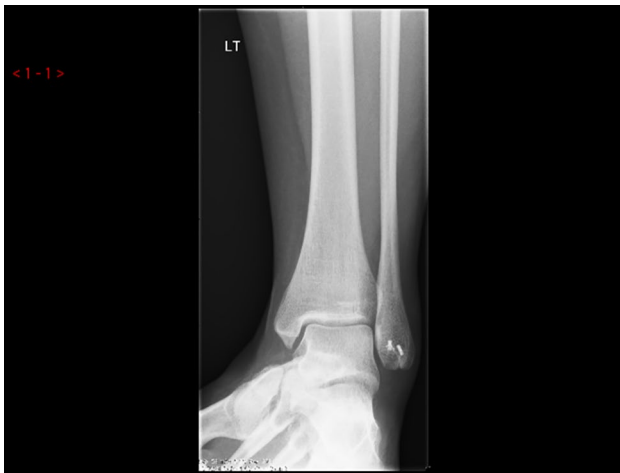
Fig. 4 Post-operative X-ray: resection of os subfibulare and repair of the ATFL with anchors

retrospective study of Phil et al., 23 children with ankle instability and os subfibulare were treated at a mean of 10.4 years with resection of os subfibulare and repair of ATFL with modified Broström technique with drill holes made through the distal fibula. At the mean follow-up of 4.5 years, all but one patient were symptom free. The mean pain level decreased from 7.2 to 2.1 at the latest follow-up. The mean Foot and Ankle Outcome Score at the last follow-up visit was 91 (range 86–99). Similar excellent results were achieved by Kubo et al. [7]. Authors carried out a retrospective study of 31 patients with chronic ankle instability and the presence of os subfibulare who had undergone resection of the ossicle with lateral ligament reconstruction using suture anchors. Clinical outcomes were evaluated by American Orthopaedic Foot and Ankle Society Ankle-Hindfoot Scale (AOFAS) and Karlsson-Peterson ankle function scores. The mean follow-up was