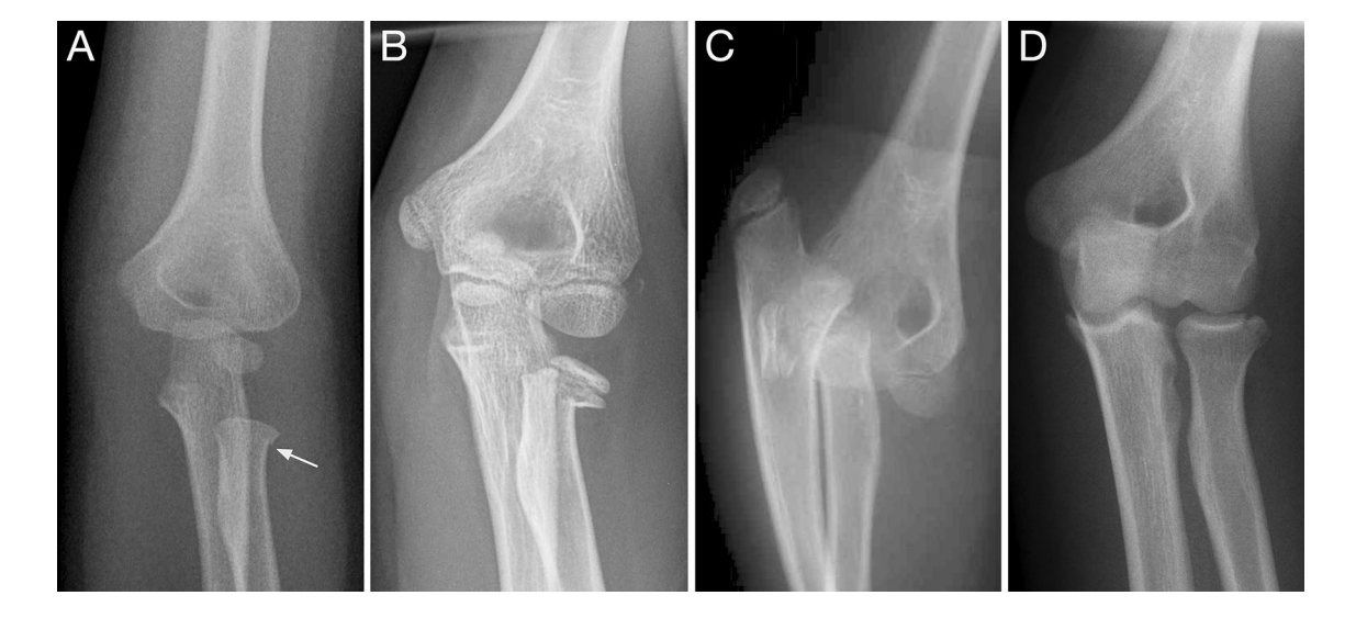
Fig. 1 Different types of proximal radius fractures representative for different dimensions of stability, courses and prognosis. Stable buckle fracture of the radial neck ( \rightarrow arrow) in a 4-year-old girl ( a ). Salter–Harris II fracture of the radial neck with the risk of further dislocation ( b ). Complete dislocation of a metaphyseal radial neck

The mean follow-up of all patients was 6.3 months (1-48) with significantly longer observation period in patients with severe displacement or additional injuries (p = 0.008,Table 3). For the last control, 11 patients showed persistent reduction of elbow/forearm movement, but no patient voiced complaints regarding their daily routine. The outcome according to the Mayo elbow performance score [13] was > 90 points in all patients, leading to an "excellent" rating (Table 2). Regarding the different fracture types, excellent results were found in stable and/or non-displaced fractures (Table 3). Excellent and good long-term results were reported in the group with displaced fractures and/or additional injuries. Surprisingly, excellent results were also observed in cases with completely displaced fractures. However, these results were obtained after surgical treatment of the abovementioned complications had been performed. The case in which a radial head resection had been performed also yielded excellent results with a Mayo rating of 100.