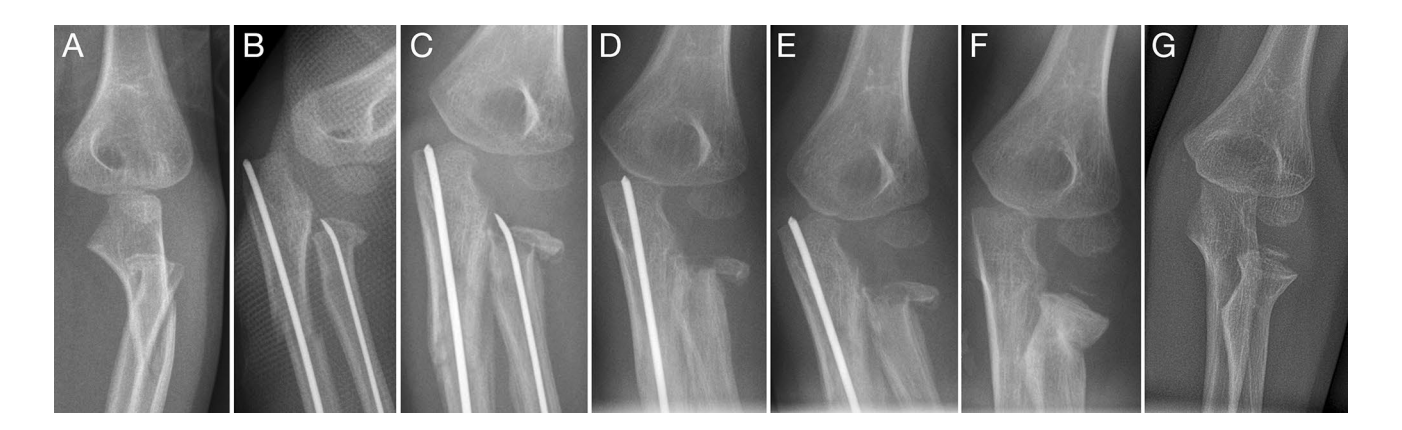
Fig. 2 Complete fracture of the metaphyseal radial neck and proximal ulna shaft fracture in a 5-year-old boy treated with ESIN ( a ). The postoperative control showed axial alignment of both fractures ( b ). Consolidation was documented after four weeks, but the radial implant showed evidently missing the radial head, which represents a technical complication that should not have been overlooked intraoperatively ( c ). Due to the consolidation process and to not further

In contrast, the presented cohort also includes movement restrictions after tolerably displaced and conservatively treated fractures. This is important given that the rate of conservative therapy (63%) considerably outweighs that of surgical treatment (37%). The reasons for the movement restrictions in this group are not obvious. In principle, atraumatic treatment is indicated for all proximal radius fractures. This includes short immobilization periods and early functional mobilization, and these have a positive effect on the final functional results after both surgical and conservative therapy, even if the mechanisms are still unknown [19]. However, in our collective, the mean immobilization time