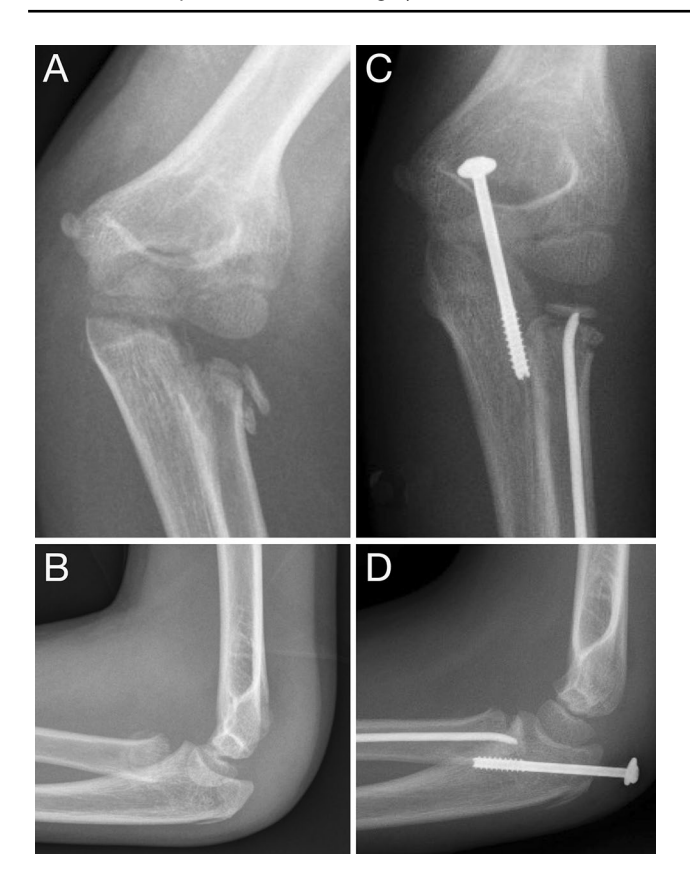
Fig.4 ESIN osteosynthesis in an eight-year-old boy with a Salter– Harris II radial neck fracture (\mathbf{a}, \mathbf{b}) . A sharpened 2.0 mm titanium nail was used for closed reduction and an additional intraarticular olecranon fracture was treated using a 4.0 mm lag screw to allow early elbow mobilization (\mathbf{c}, \mathbf{d})

a frisbee-like clamping of the radial head and is, to the best of our knowledge, reported here for the first time (Fig. 3). This procedure prevents the moving or sintering of the radial head following complete disruption of the nutritive vessels, and thus enables a delayed consolidation despite the risk of dislocation in this condition. In this study, no one used ESIN exclusively as an instrument for reduction and pulled the nail out immediately thereafter. This idea is based on the theory that the radial head, replaced between the metaphysis and the capitellum, is sufficiently fixed by the surroundings, making the nail dispensable [28]. The authors of this article believe that the second anesthesia for metal removal is less burdensome for the patient as opposed to risking secondary dislocation with subsequent surgical interventions. Resorbable implants may further reduce the invasiveness of the treatment by eliminating the need for metal removal. The implants might also further reduce the rate of typical ESIN complications (e.g., irritation of soft tissues by nail ends) [29, 30]. Whether these implants also offer the desired biomechanical properties (e.g., sharpened nail ends for better reduction) must be demonstrated in focused long-term studies.