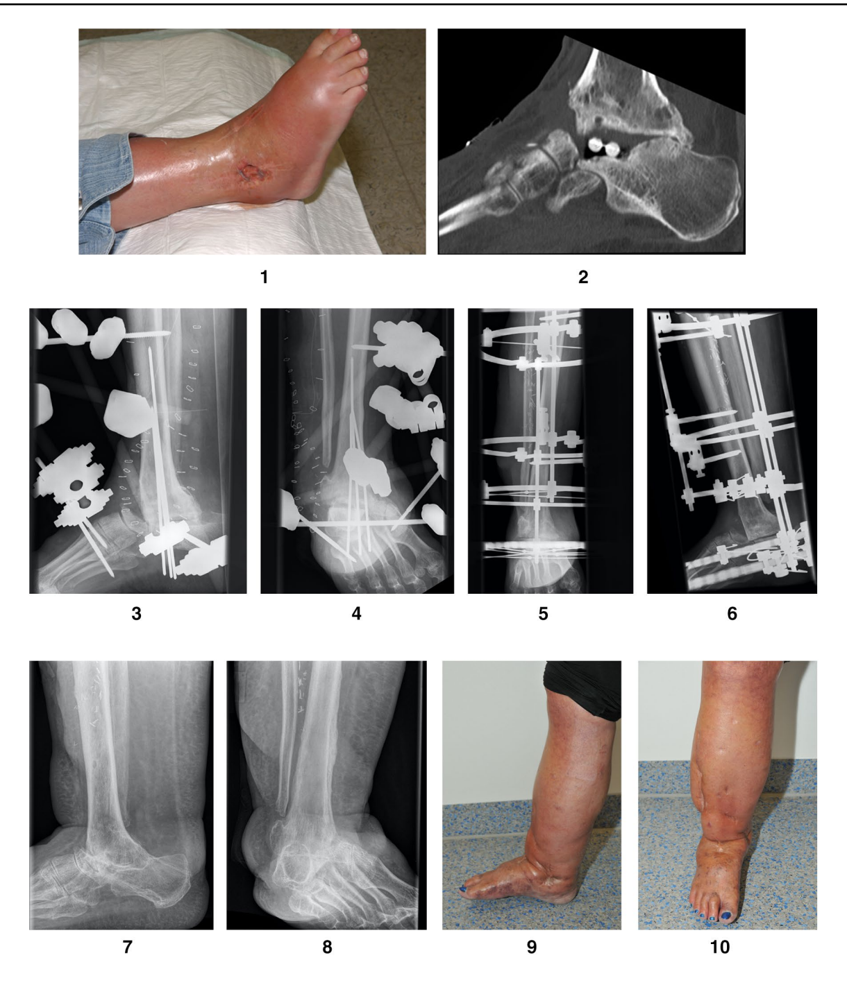
Figs. 1 Figs. 1, 2 : Patient 1—a 49-year-old woman presented with florid infection and destruction of the subtalar joint and talus and pre-existing arthrodesis of the ankle after an initial fracture and multiple operations. When the patient was referred to our hospital, antibiotic chains were still present in the subtalar joint. Figs. 3, 4 : Patient 1—x-ray image after talus resection, extensive debridement and placement of an AO fixator. The talus was completely destroyed due to infection, which is why it was completely removed. After initial VAC therapy,