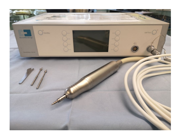
Fig. 1 Hand piece, drill bits and BoneWelding® melting machine

A standardized follow-up protocol was conducted after 6, 12, and 52 weeks. The ulnar collateral ligament stability was tested manually by means of subjective assessment by a doctor. Pain at rest and during load was recorded on the visual analog scale (VAS). Patient satisfaction was recorded with a three option grading system (very satisfied, partly satisfied and not satisfied). The range of motion of the metacarpophalangeal joint was