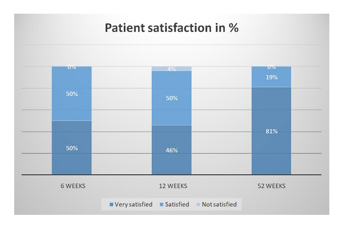
Fig. 5 Patient satisfaction rate after 6, 12 and 52 weeks

Complications or AEs were reported in eleven cases. One patient sustained a wrist fracture while playing sports, which was unrelated to the evaluated surgery or anchor. Two patients showed a transient neurapraxia of the superficial radial nerve. One patient presented excessive pain due