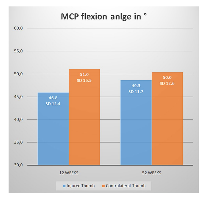
Fig. 3 Comparison of metacarpophalangeal (MCP) joint flexion of the thumb after 12 and 52 weeks between the injured and contralateral thumb

Results are presented using descriptive statistics which were calculated with Microsoft Excel (Microsoft Corporation, Redmond, Washington, USA).