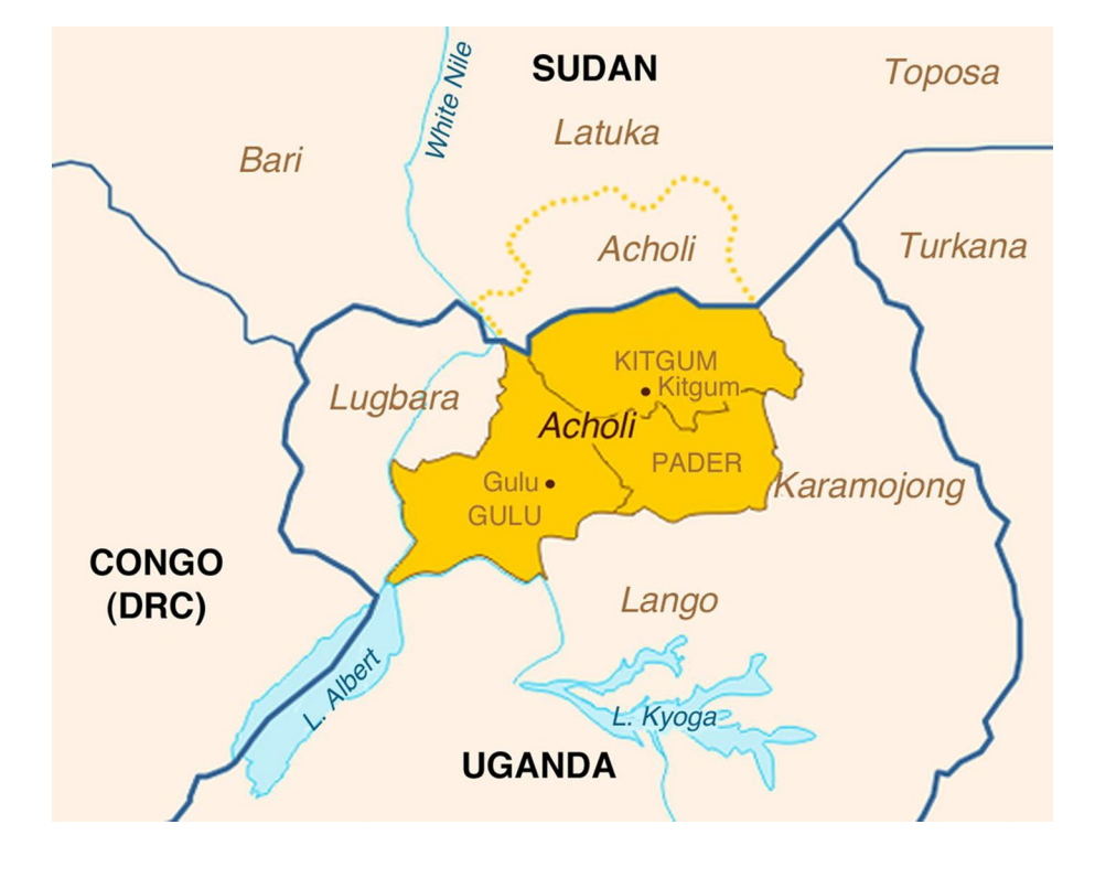
Fig. 1 Three districts in northern Uganda affected by nodding syndrome [11]

Globose tangles, pre-tangles and threads were found in various subcortical and brainstem sites (Fig. 2). The tegmental nuclei of the upper brainstem, including the Edinger–Westphal nucleus, substantia nigra, locus coeruleus and the nuclei of the pontine base were preferentially affected. Less extensive formation of tangles, pre-tangles and threads was found in the striatum, lentiform nuclei thalamus and medulla. There was relatively