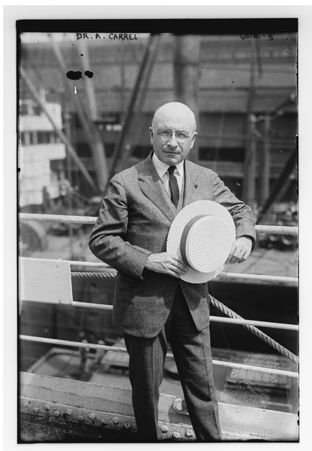
Picture 6 Alexis Carrel