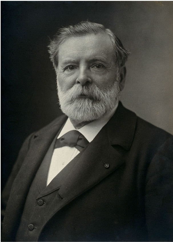
Picture 2 Étienne-Jules Marey