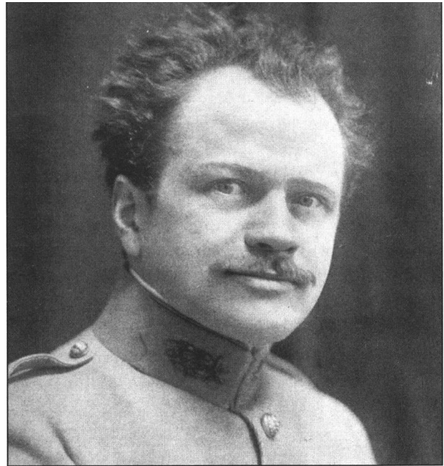
Picture 3 René Leriche 1915

Helen Taussig was nominated 24 times from 1947 to 1953 by nominators from, predominantly, the United