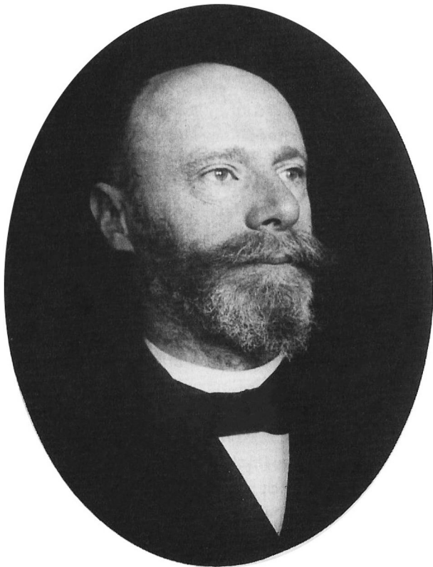
Picture 5 Willem Einthoven 1906