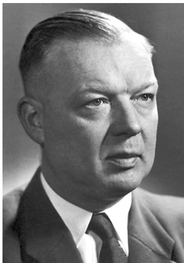
Picture 7 Werner Forssmann

In addition, the Nobel Prizes of 1964, 1982 (Captopril), 1985, and 1998 (Nitrates) were also awarded for discoveries in the field of cardiovascular research which led to new drug therapies. The cholesterol metabolism, for example, which served as motivation for the Nobel Prize twice in both 1964 and 1985, led not only to a deeper understanding of the pathology of cardiovascular diseases but also to the development of cholesterol-lowering drugs such as statins. As the Nobel archives become available for the 1970s, it will become possible to see how the committee responded to other wide-reaching discoveries in the field, such as heart transplantation, coronary artery grafting in cardiac surgery, and angioplasty of coronary arteries [30–33]. Given the 50-year embargo on Nobel nominations and evaluations, such evaluation processes are kept a cliff-hanging secret [34]. The background of a prize decision and the reasons for or against a candidate are, therefore, only speculations. That being said, the current composition of the Nobel Committee reveals that neither clinicians nor cardiovascular researchers on board form part of the committee, which could put a potential barrier in the way of cardiovascular researchers.