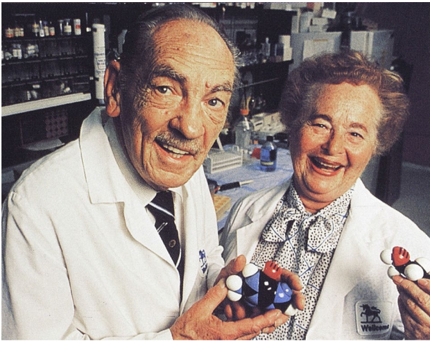
Picture 9 George Hitchings and Gertrude Elion