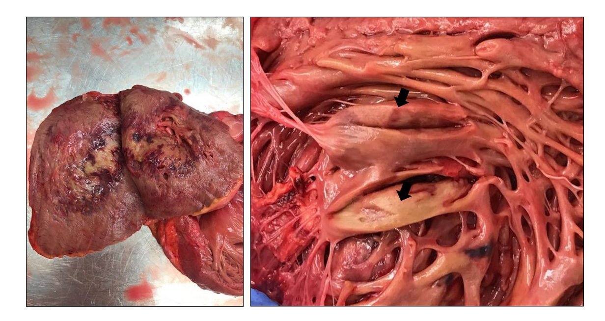
Fig. 4 Autopsy revealed acute and extended myocardial ischemia of the lateral wall of the left ventricle (left) and rupture of the ischemic papillary muscle. Arrows mark "tiger sign" of the papillary muscle indicating ischemic damage