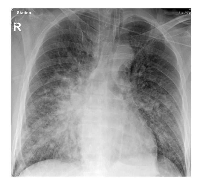
Fig. 1 Chest X-ray on admission