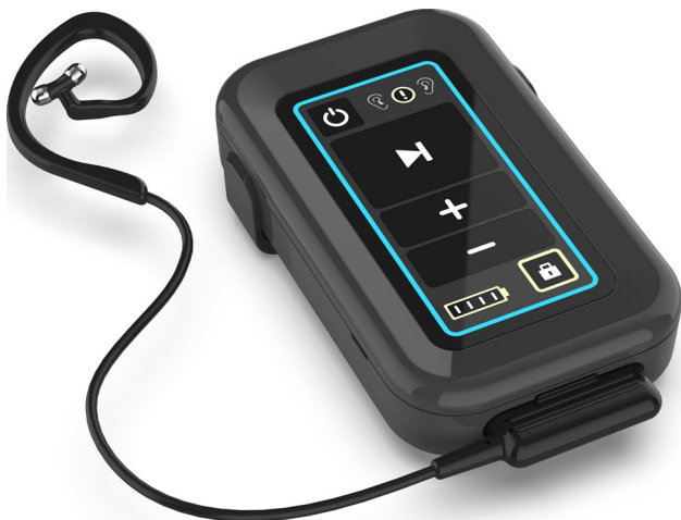
Fig. 1 The tVNS@L-device for taVNS, provided by tVNS Technologies GmbH, Germany

The NeuroSIRS-Study is a prospective, randomized, two-armed, sham-controlled, double-blind, exploratory clinical trial in healthy subjects. It is a pilot study with the intention to gain first insights into the primary and secondary objectives. Therefore, sample size is not based on a statistical rationale. Thirty participants will be enrolled in the study: 15 subjects in the experimental group and 15 subjects in the control group. Healthy volunteers will be recruited by advertisements placed at the University Hospital of Bonn and in the local newspaper. During the