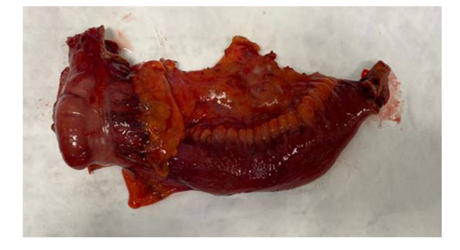
Fig. 3 Extended mesenterectomy