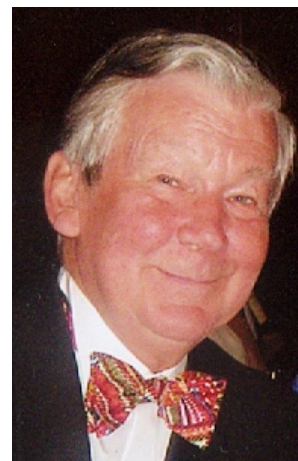
Fig. 1 Professor Alois F. Schärli (1934–2018)

chapters and six textbooks including an authoritative text book for nurses.