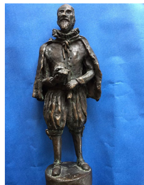
Fig. 4 Bronze sculpture of Ambroise Paré, a famous sixteenth century French surgeon, who first described diaphragmatic hernia in 1575