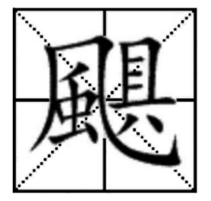
Fig. 1. The Chinese character [颶] included in Kangxi Dictionary .

countries regard these storms as black winds." d