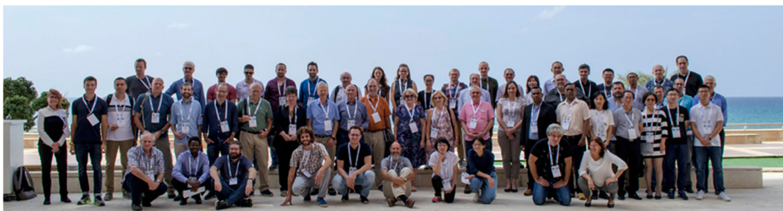
Fig. 1 Conference participants at GIMS-14 in front of the eastern Mediterranean and submerged Levantine Basin

The second collection of papers addresses methane-derived authigenic mineralization. Judd et al. (2020) examine methane-derived authigenic carbonates (MDAC) from the UK sector of the Irish Sea. Their results suggest the continual formation of MDACs since the last glacial maximum and that methane release to the atmosphere occurred immediately after the local ice sheet retreat. The foraminiferal record of stable isotopes as related to gas hydrate flows is tackled by Dessandier et al. (2020), who investigate the potential biases of these records due to ontogenetic effects. The controls of greigite preservation are examined using rock-magnetic and transmission electron microscope analyses from cores of the Krishna-Godavari basin of India by Badesab et al. (2020a). They suggested that silica diagenesis and silicate weathering, triggered by paleo-methane seepage, played a key role in crystallizing diagenetically formed iron sulfide (greigite) into a silicate matrix, thus enhancing preservation potential.