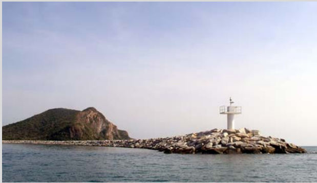
Fig. 1 The 800 m long breakwater located at the Royal Thai Navy, Sattahip, Chonburi Province

Received: 29 September 2008 / Accepted: 25 November 2008 / Published online: 17 December 2008 © Springer-Verlag 2008