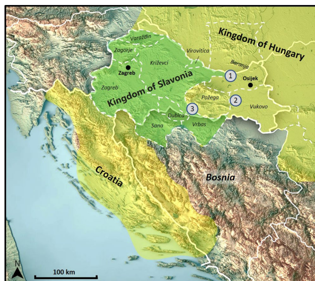
Fig. 2 Map showing the Kingdoms of Hungary and of Slavonia ( Regnum Sclavoniae ) in the middle of the 14th century and divisions of Slavonia into zupanija (regions) (adapted from Regan 2003, pp 143–144, map 90–91)

Slavonia became incorporated within Croatia (present-day central Croatia) (Andrić 2001, pp. 60–61).