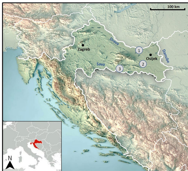
Fig. 1 Location of the medieval settlements; 1, Donji Miholjac-Đanovci (DM-D); 2, Đakovo-Franjevac (D-F), Tomašanci-Palača (T-P), Pajtenica-elike Livade (P-VL), Jurjevac-Stara Vodenica (J-SV), Ivandvor-Šuma Gaj (I-SG), Ivanovci Gorjanski-Palanka (IG-P); 3, Bijela Stijena, Rašaška, Sv. Ivan Trnava (adapted from Ramsrott 2017)

Today Slavonia is located in the eastern part of northern (continental) Croatia (Fig. 1). However, in the Late Middle Ages, the name Slavonia referred to the western part of continental Croatia, an area that lies between the rivers Sava, Drava, Sutla and Dunav (Danube) and included some parts of modern northern Bosnia and Hercegovina (Fig. 2). The eastern part of continental Croatia has no clear historical data but would have come under the jurisdiction of the Kingdom of Hungary. During the 16th and 17th centuries the area of Slavonia moved further east to form present-day Slavonia as it has remained. At that time, the region of old medieval