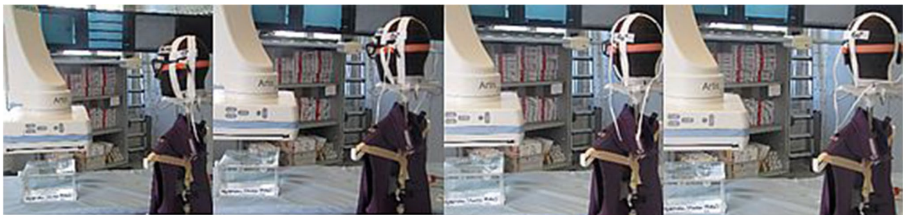
Fig. 3 Experimental set-up: Generating eye dose values under protected conditions considering varying viewing directions (0°, 20°, 40°, 60°)

the same as the previous one with regard to an eye level of 176 cm and 0° head rotation. The pelvic DSA-program was set to 7.5 frames/s over 40 s for each magnification mode. Radiation dose was detected by RaySafe i3 dosimeter continuously. Three magnification modes represented by their FOV-diagonals (48 cm, 32 cm, 11 cm) were in use. FOV-48 was defined the baseline for further analysis.