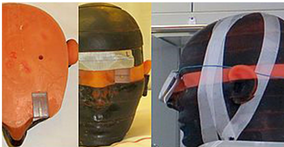
Fig. 1 Positioning of dosimeters (TLDs, RaySafe i3) at the phantom head

In a second trial, RaySafe i3 PDM was placed at the nasal root of the dummy for getting representative eye dose values over both sides (Fig. 1). The experimental setup was