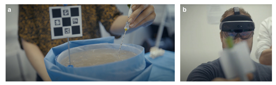
Fig. 1 a A ChArUco marker in a phantom. b A user wearing the HoloLens 2<sup>TM</sup>

disagreed. One user struggled slightly with the hardware and one user commented "I had a few difficulties with the headset in the beginning; figuring out exactly what to say and what it does".