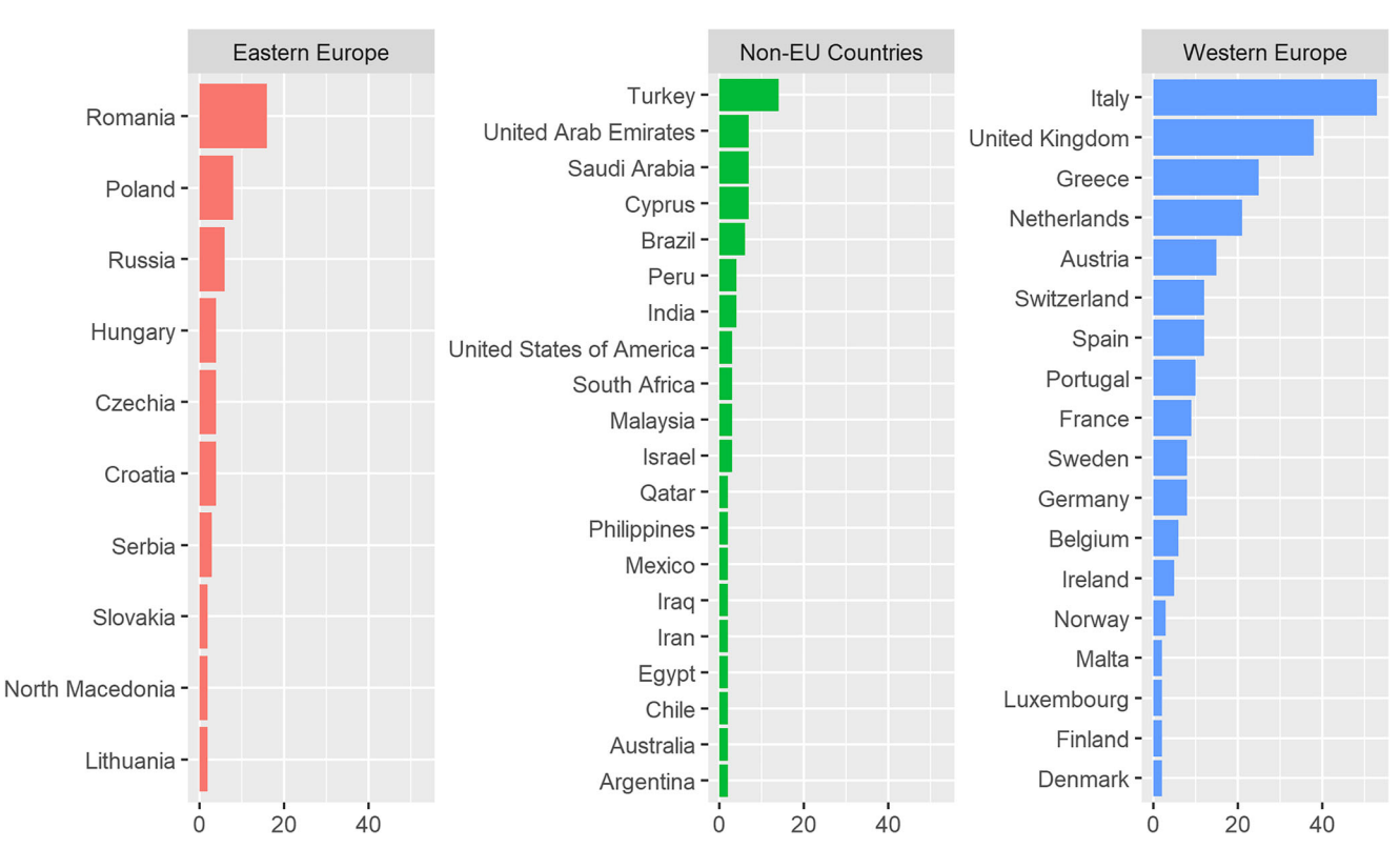
Fig. 1 Geographic origin of participants to the survey, grouped by three different areas. Countries with less than two respondents were not plotted

Attitude towards BAC reporting was not significantly influenced by gender, age, geographic origin, job position, years