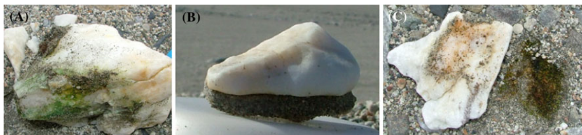
Fig. 1 Representative examples of type I cyanobacterial (a), type II fungal (b) and type III moss (c) hypoliths

For each hypolithon, the following were recorded in the field: Type I, II or III according to Cowan et al. (2010); GPS location and altitude (Garmin 60C) that was later integrated with a Geographic Information System (ArcView GIS v 9.3.1; ESRI, USA) to produce a distribution map; Rock dimensions (L × W × D; using a Vernier calliper); Incident and transmitted photosynthetically active radiation (PAR, 400–700 nm) (Licor Li-189 PAR sensor, Licor Inc, Lincoln, NA); Incident and transmitted UV A and UV B irradiance (UVX radiometer, UVP Inc, Upland, CA). Transmitted PAR, UV A and UV B were measured by placing the rock on the sensor (a collar of plasticine was used to prevent light leakage) and averaging readings from four 90° orientations. In addition, soil samples (<10 g) were also recovered from directly below each hypolithon into air-tight vials for subsequent water content analysis. Gravimetric moisture content was determined in the laboratory after heating to 105°C and re-weighing to constant dry weight over 24 h.