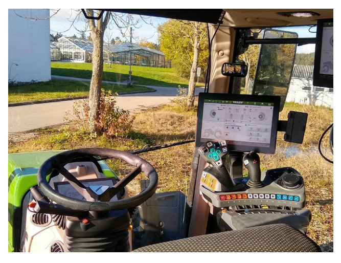
Fig. 1 The inside of a modern tractor cabin. The main terminal can be seen behind the joystick

• Tractor-Implement Management (TIM): A protocol to allow the implement to drive the tractor (set the speed, steer, etc.). This improves accuracy because implements could have special sensors to detect their optimal conditions as they travel through the field, e.g., sensors to detect if the quality of work is suffering over a certain speed, or sensors to detect if the implement is correctly positioned within the crop row.