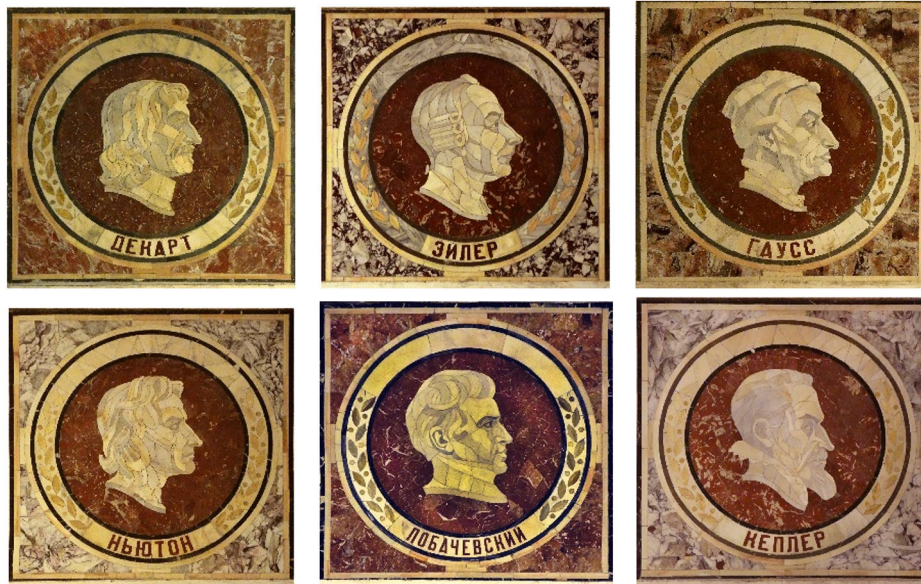
Figure 2. Top row: René Descartes, Leonhard Euler, Carl Friedrich Gauss. Bottom row: Isaac Newton, Nikolai Ivanovich Lobachevsky, Johannes Kepler.