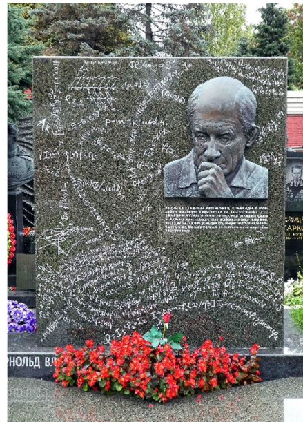
Figure 10. Left: memorial plaque to Israel M. Gelfand at the Belozersky Institute of Physical-Chemical Biology of MSU. Right: tombstone of Vladimir I. Arnold at the Novodeviche Cemetery.

properly recognized in his own country. By the time he was elected a full member of the Soviet Academy of Sciences in 1984, he had already become a foreign member of the U.S. National Academy of Sciences (1970), the Royal Swedish Academy of Sciences (1974), the French Academy of Sciences (1976), and the Royal Society (London, 1977), and he had received the first Wolf Prize in Mathematics (1978). When he was finally allowed to travel, in 1989, the 76-year-old Gelfand moved to the United States and built up a strong research program at Rutgers University, in New Jersey.