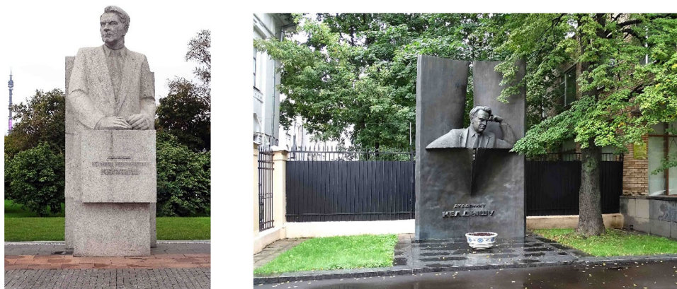
Figure 8. Left: Statue of Mstislav V. Keldysh by Yuri L. Chernov next to the monument “Explorers of Space” in Ostankino Park. Right: Memorial to Mstislav V. Keldysh in front of the Keldysh Institute of Applied Mathematics, 4 Miusskaya Square. Photographs by the authors.

Israel M. Gelfand (1913–2009; Figure 10, left) had a brilliant career in mathematics despite the barriers put up by the Soviet regime and the fact that his anti-Semitic peers prevented his professional advancement and foreign travel. He organized a famous biological seminar for the application of mathematics to biology and served in a professorial appointment at the Belozersky Institute of Physical-Chemical Biology of MSU between 1965 and 1991. He had other jobs simultaneously at the Keldysh Institute of Applied Mathematics and at Moscow State University, where he taught mathematics beginning in 1935. He was one of the great mathematicians of the twentieth century, with broad international recognition long before he was