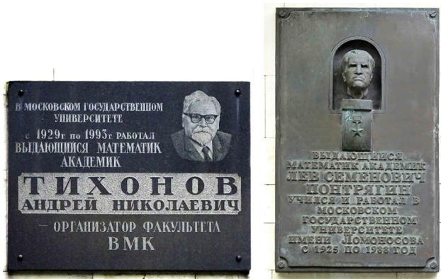
Figure 6. Memorial plaques on the façade of the Faculty of Computational Mathematics and Cybernetics of MSU. Left: Andrei N. Tikhonov. Right: Lev S. Pontryagin.

Andrei N. Tikhonov (1906–1993) studied at Moscow University, where he majored in mathematics (Figure 6). Upon graduation, he remained at his alma mater in the Faculty of Physics and Mathematics, which in 1933 was divided into the Faculty of Mechanics and Mathematics and the Faculty of Physics. Tikhonov moved with the Faculty of Physics, where he worked at its Department of Mathematics, serving as its chair between 1938 and 1970. At the