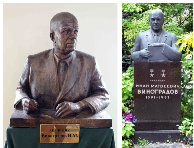
Figure 7. Left: Memorial to Ivan M. Vinogradov at the Steklov Institute of Mathematics of the Academy of Sciences, 8 Gubkin Street. Right: His tombstone at the Novodeviche Cemetery.

Lev S. Pontryagin (1908–1988) experienced a childhood tragedy. When he was 14 years old, an oil stove exploded near him. His face was badly burned, and he lost his eyesight. From that point on, his mother became his eyes. He graduated from Moscow University in 1929, where he remained, being named professor of mathematics in 1935. He was also a leading associate at the Steklov Institute of Mathematics; see Figure 6. He was very successful in the applications of mathematics to practical problems. The dark side of his career and personality was his rabid anti-Semitism. He was successful in preventing even the most outstanding Jewish mathematicians from attending