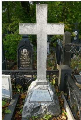
Figure 3. Left: Luzin’s portrait displayed in the gallery of renowned former institute members on the ninth floor of the Steklov Mathematical Institute of the Academy of Sciences. Right: Luzin’s tombstone at the Vvedenskoye Cemetery, 1 Nalichnaya Street.

research for the duration of World War II, devoting his efforts to assisting the artillery. Later in his career, he helped to reform the teaching of high-school mathematics. After the collapse of the Soviet Union, many of his disciples became professors of mathematics in leading Western universities.