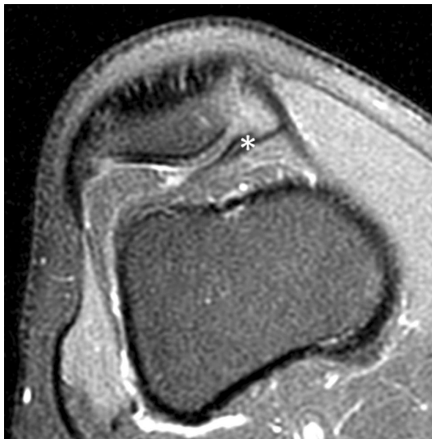
Fig. 1 Magnetic resonance imaging of a duplicated medial plica (asterisk)