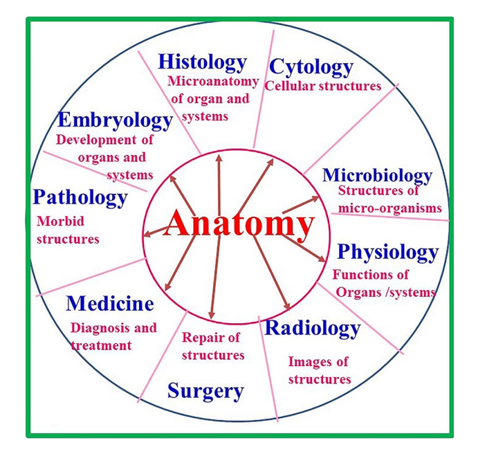
Fig.1 Shows how various subjects of Medical Education evolved from Anatomy

In daily medical practice, "anatomy is important for physical examination, symptom interpretation and interpretation of radiological images. Knowledge of anatomy is essential for understanding neurological or musculoskeletal disorders [23]."