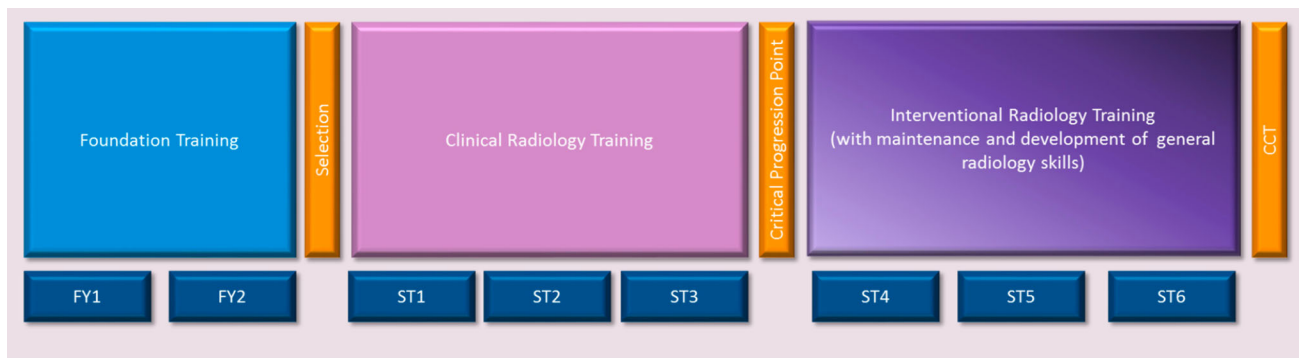
Fig. 1 Training pathway for interventional radiology