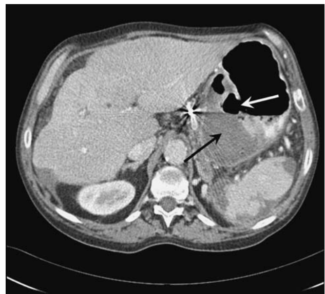
Fig. 3 CAT scan showing a connection (white arrow) between the stomach and the pancreatic pseudocyst (black arrow)