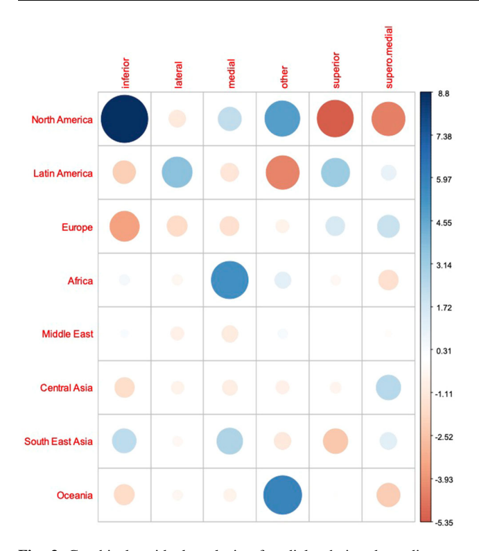
Fig. 3 Graphical residual analysis of pedicle choice depending on geographic region. Positive association between categories is indicated by blue color, negative association by red color. The size of the circle and transparency of the color refer to the strength of the association between the categories

[16–18]. However, there is variation with regard to the pedicle recommended even for primary breast reduction surgery based on vascular anatomy. Perfusion of the NAC can be highly variable, with different patterns existing even between two breasts of the same patient. According to the cadaveric study of van Deventer et al., an inferomedial