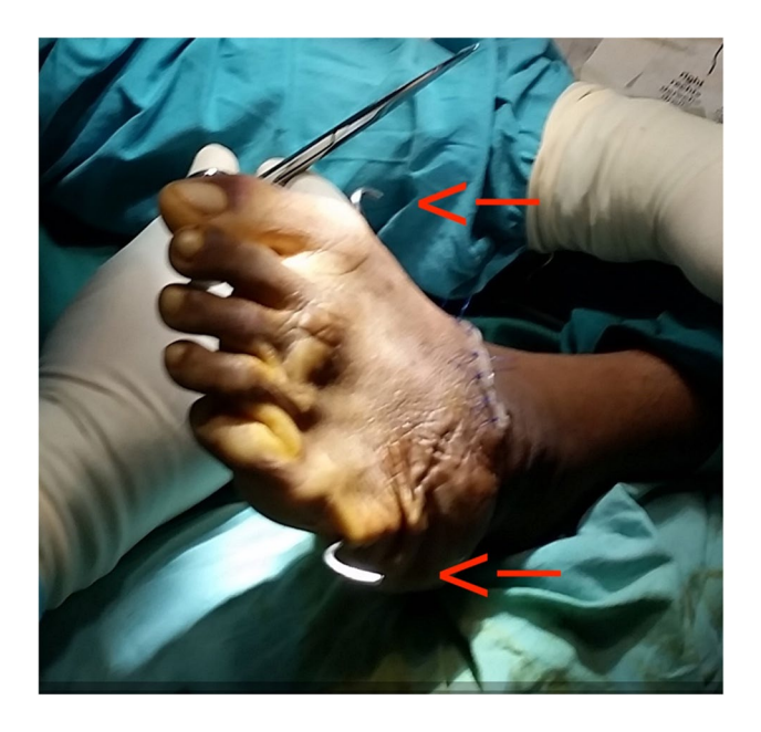
Photos. 15-17 Intra-operative results of triple arthrodesis showing position of dorsal incision and the 2 crossing k-wires (red arrows)

Comparing outcomes after surgical treatment for neglected clubfoot between studies from LMICs remains very difficult, because of a plethora of inclusion criteria, surgical techniques, and evaluation criteria used. Comparing outcomes between Ponseti treatment and surgical care in LMICs remains equally difficult [21]. However, studies from high-income countries clearly show that long-term outcome of surgically treated clubfoot is poorer compared to feet treated with the conservative Ponseti treatment protocol, in terms of pain and foot morphology [13, 22–24]. Studies about the effectiveness of Ponseti treatment in children above walking age in LMICs show promising results. Extensive soft tissue releases have been avoided in 66–92% of cases above 1 year of age [8, 25, 26]. The Ponseti treatment remains the golden standard for clubfoot treatment in low-, middle-, and high-income countries [7–9]. As such, we strongly believe that Ponseti casting should remain the