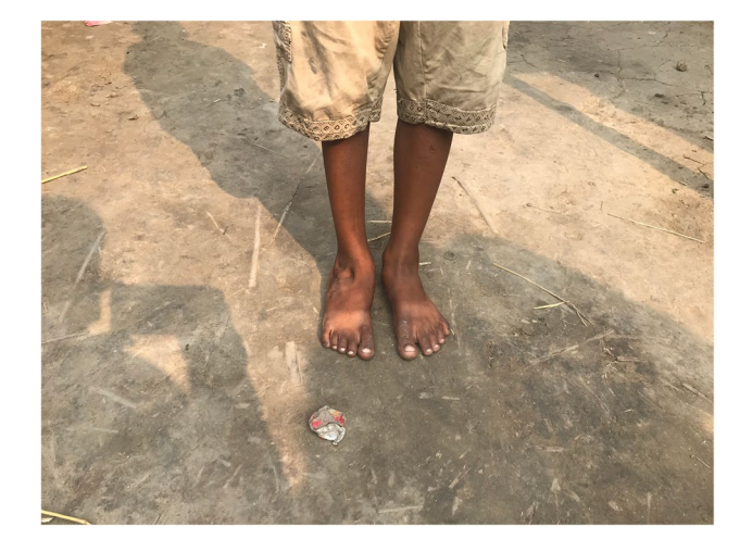
Photos. 1-3 Two-year post-operative status after right PMR with TATT in 5-year-old boy

CTEV: congenital talipes equinovarus PMR: Posteromedial release NWB: non-weight bearing WB: weight bearing