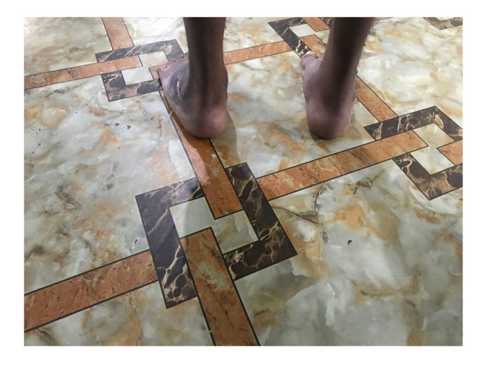
Photos. 10-14 Pre-operative and 2-year post-operative status after bilateral triple arthrodesis in a 21-year-old man

The social questionnaire at two year follow-up showed that all 19 evaluated patients were enrolled in school or employed and were able to wear normal shoes. Only 1 patient (bilateral triple arthrodesis) was not able to squat and