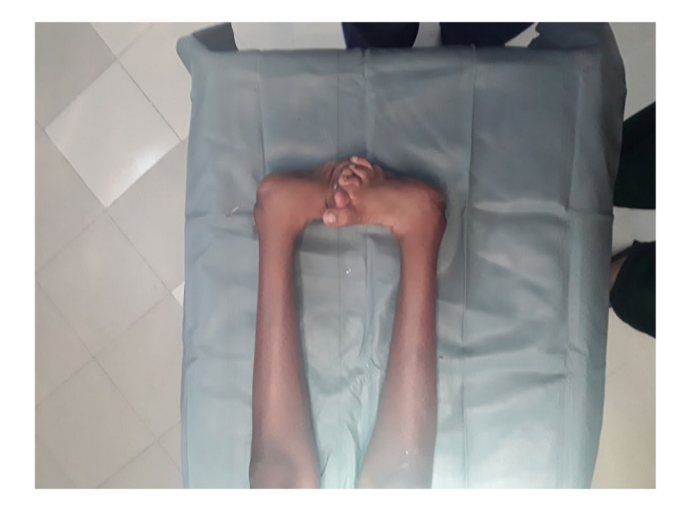
Photos. 4-9 Pre-operative and 2-year post-operative status after bilateral PMR with cuboid osteotomy in a 9-year-old boy

For the statistical analysis, patients were divided into three groups: group 1 received a PMR with or without tibialis anterior tendon transfer (TATT) but without additional bony procedures, group 2 received a PMR with at least one