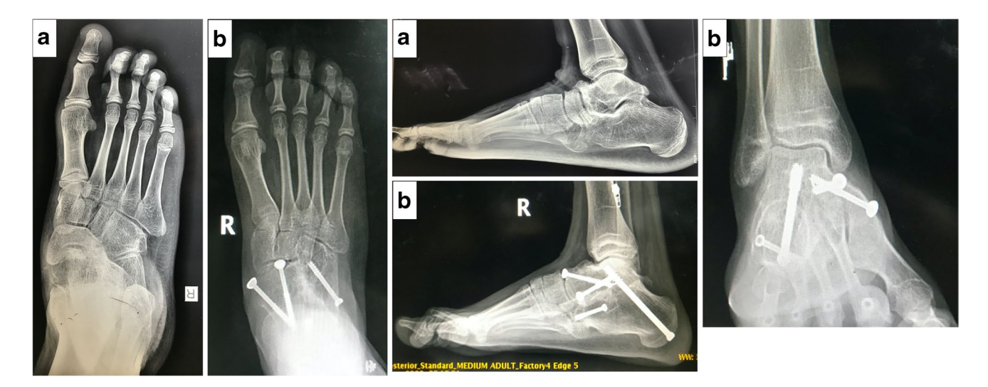
Fig. 2 Pre-operative ( a ) and 12 months post-operative ( b ) standing foot radiographs of a triple arthrodesis. This 16-year-old male patient with right-sided PTTI stage III had a significant improvement in his