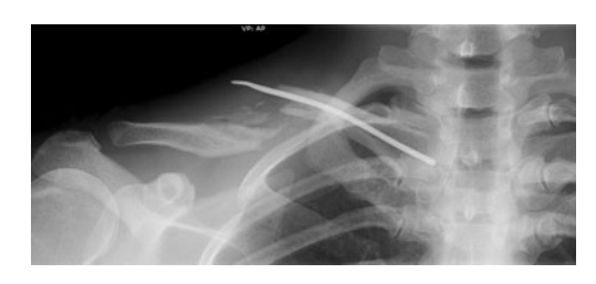
Fig. 3 Example of implant failure of a TEN

In the ESIN group 45 TEN of the total 47 TEN were removed. In the plate group 27 patients (total of 43 patients) underwent removal of the implant material. The median time until removal in all 72 patients was six months (IQR 4–11). In the ESIN group the implants were removed at a median of five months (IQR 4–6). Plates were removed at a median of 11 months (IQR 7–15) (p<0.001, Table 2).