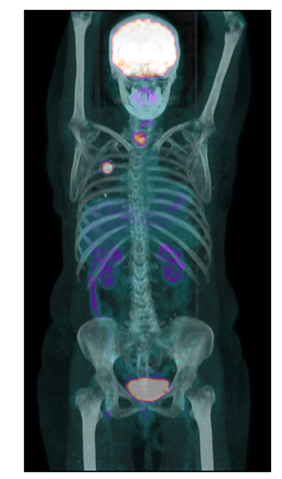
Fig. 3 A scan showing one of the powers of PET/CT: In a patient with an isolated tumour in the upper right lobe of the lung, PET/CT revealed a potential lymph node metastasis just above the centre of the right diaphragmatic dome and an unknown lesion in the thyroid gland, not detected during work-up or by other imaging, but verified by biopsy following PET/CT

There was good evidence to recommend PET/CT for staging, response and end evaluation of patients with Hodgkin's and diffuse large B-cell lymphoma [23–28]. Considerable beneficial effect has been reported in the shape of change in stage and therapy and with regard to prediction of progression-free survival [29, 30]. PET/CT helps to identify patients not in need of additional radiotherapy and is recommended before high-dose chemotherapy with stem cell support in patients with relapse, as all studies showed shorter progression-free survival with PET/CT positivity [31–34]. Thus, PET/CT may play a future role for the selection of patients for this kind of therapy.