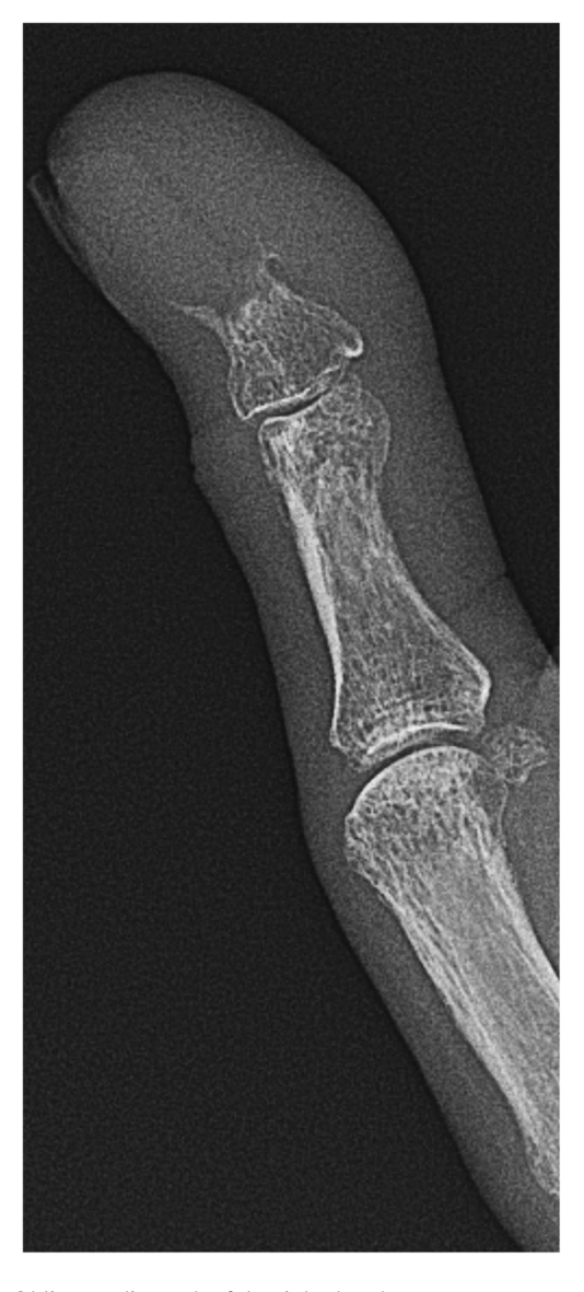
Fig. 2 Oblique radiograph of the right thumb

The diagnosis can be found at https://doi.org/10.1007/s00256-023-04472-8