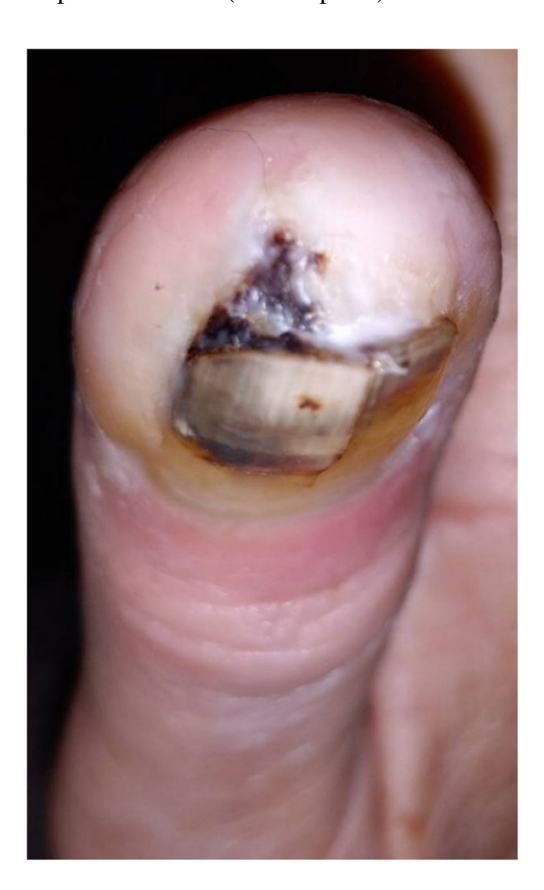
Fig. 1 Photo of the right thumb on presentation

worker. She has a history of fibromyalgia and spinal stenosis with a recent history of lumbar fusion. There was no history of fever, trauma, or any underlying inflammatory arthropathy (Figs. 1, 2, and 3).