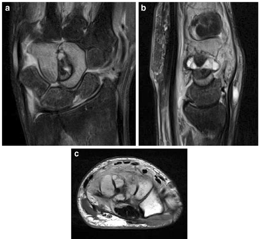
Fig. 2 a Coronal STIR, b sagittal STIR and c axial PDW FSE MR images of the left wrist