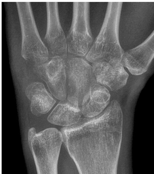
Fig. 1 Anteroposterior radiograph of the left wrist

A 29-year-old male with a long history of atraumatic left wrist pain.