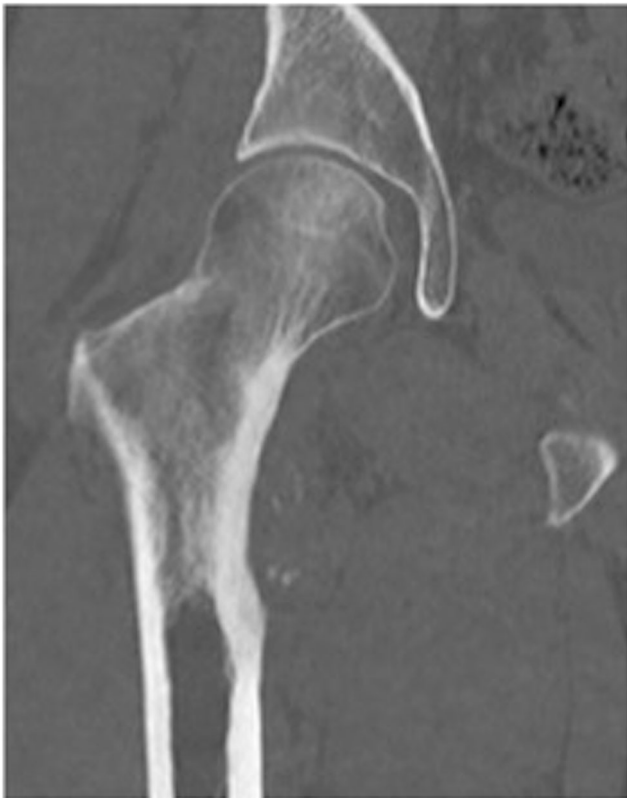
Fig. 3 Coronal CT image of the right hip