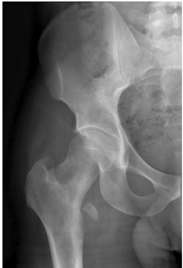
Fig. 1 AP (anteroposterior radiograph) of the right hip

A 32-year-old male presented with right medial hip pain following an injury sustained doing martial arts.