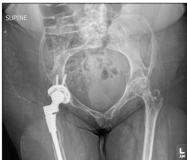
Fig. 1 AP radiograph of the pelvis

Thirty-nine year old female with a history of Athrogyroposis Mutiplex Congenta, chronic bilateral hip dislocation, right hip arthroplasty and recent trauma. AP Pelvis radiograph (Fig. 1) and non-contrast CT of the Pelvis (Fig. 2) were performed to evaluate for fracture.