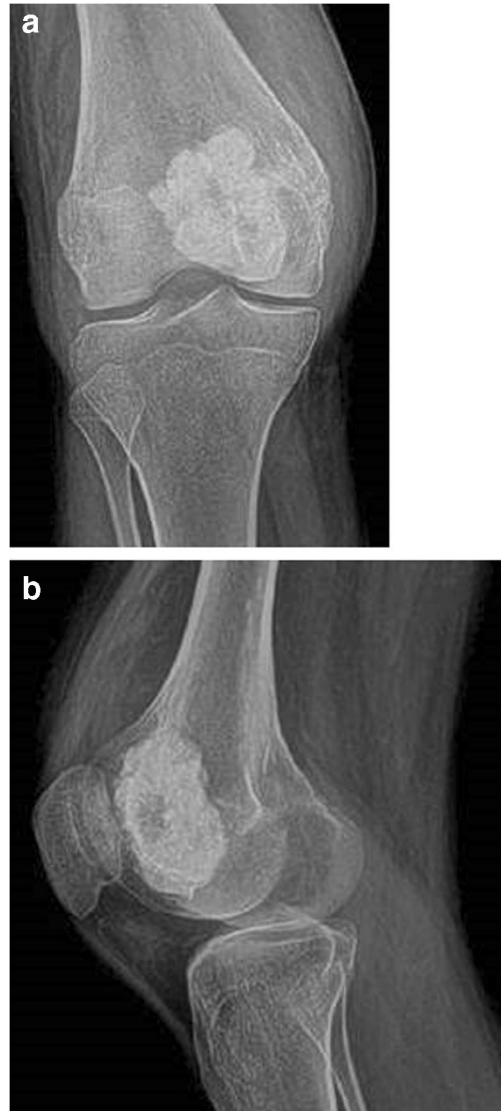
Fig. 2 a AP and b Lateral radiographs of the right knee