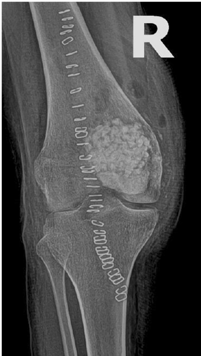
Fig. 5 AP radiograph of the right knee immediately post curetting and packing with bone graft substitute