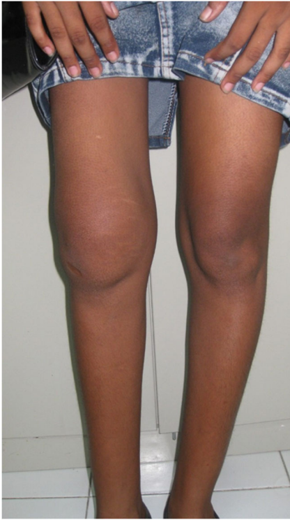
Fig. 1 Clinical photograph of both knees showing marked swelling of the right knee