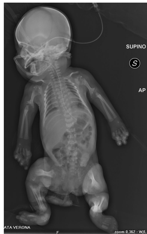
Fig. 2 AP radiograph of the entire skeleton