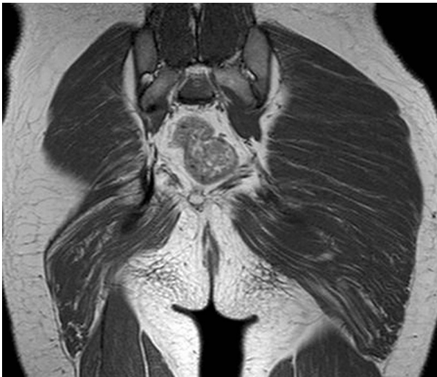
Fig. 1 Coronal T1-weighted image

QUESTION -Male patient in his twenties, referred to MRI with an asymmetry in his right buttock and difficulty in squatting (Figs 1, 2, 3, and 4).