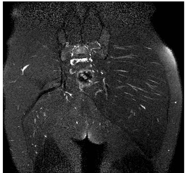
Fig. 2 Coronal fat saturated T2-weighted image

The diagnosis can be found at doi: 10.1007/s00256-016-2519-z