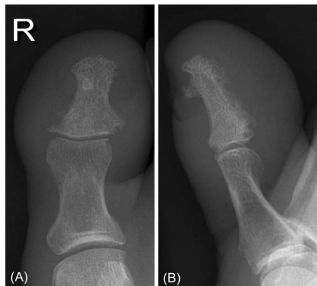
Fig. 2 Radiographs. a Frontal and b lateral

The diagnosis can be found at doi: 10.1007/s00256-013-1682-8