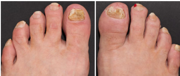
Fig. 1 Photographs of the right and left toes

A 55-year-old female patient with a history of palmoplantar pustular psoriasis presented with a 12-month history of nail dystrophy that was followed by swelling and erythema of the right great toe for 6 months. She was otherwise well with normal baseline blood tests and chest X-ray. No improvement was evident with multiple courses of antibiotics.