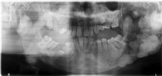
Fig. 1 Panoramic radiograph

Twenty one year old draftee under evaluation of medical qualification. A panoramic radiograph (Fig. 1) and CT scan of his skull (Fig. 2) was performed.