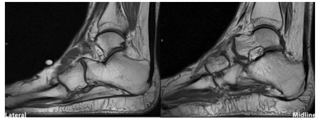
Fig. 2 Sagittal right foot view