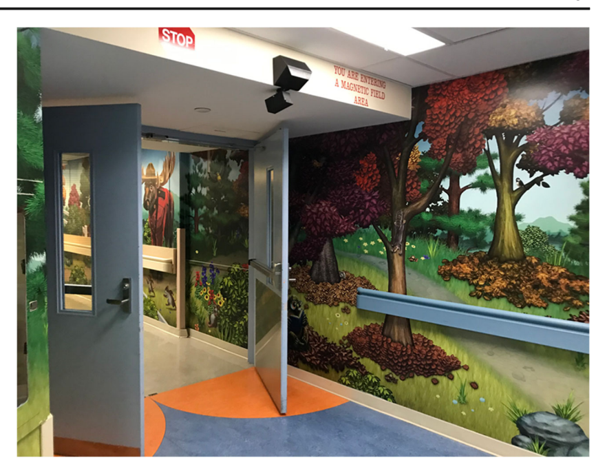
Fig. 6 Clinical image of MRI area wall decorations

respiration, as well as children undergoing MRI with sedation who are allowed to breathe spontaneously. Finally, artificial intelligence and deep learning algorithms are also being developed that can restore diagnostic image quality associated with sparse or motion-degraded MR images [58].