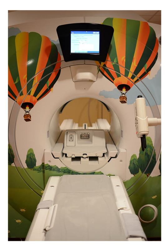
Fig. 5 Clinical image of MRI scanner decorations

Parallel imaging methods enable undersampling of k-space through the use of phased-array coils with multiple receiver elements to assist spatial localization [48]. Parallel imaging acceleration is routinely used clinically to accelerate MR acquisition by not sampling some lines of k-space in the phase-encoding direction while estimating missing information from coil sensitivity profiles of adjacent receiver elements. Parallel imaging usually leads to 2- to 3-fold acceleration, although