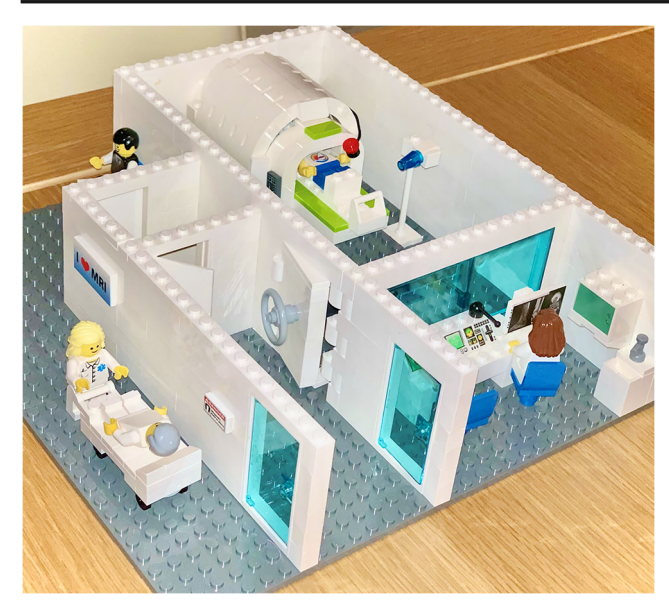
Fig. 2 MRI area prototype with LEGO bricks (I love MRI build your own MRI with LEGO bricks, an initiative lead by Dr. Ben Taragin from the Children's Hospital at Montefiore (USA), Dr. Erik Ranschaert from the Jeroen Bosch Hospital (The Neatherlands), and the Society for Pediatric Radiology

customized play therapy with pediatric patients undergoing diagnostic MRI has also been shown to significantly reduce the use of sedation [41] (Fig. 3). The use of immobilization devices is also critical, especially among infants [1, 14].