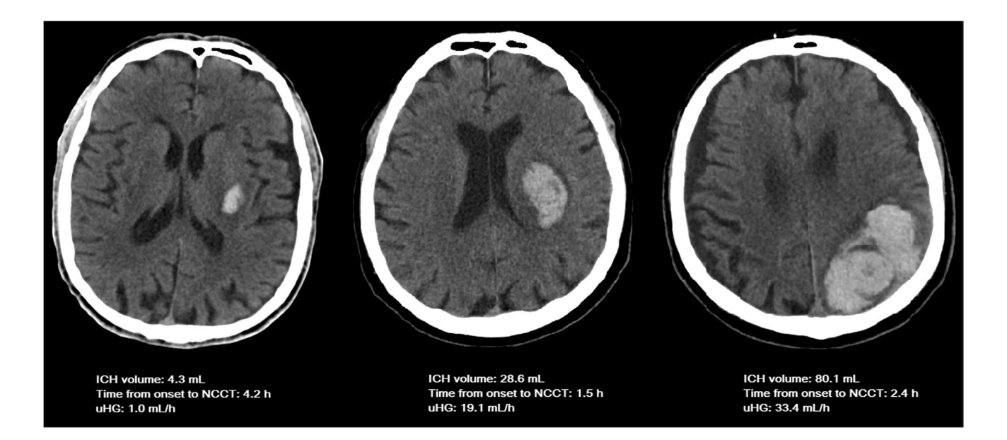
Fig. 1 Ultraearly hematoma growth. Illustrative example of the definition and calculation of ultraearly hematoma growth (baseline ICH volume/time from onset to NCCT). ICH indicates intracerebral hem-

NCCT scans were acquired with 3- or 5-mm slice thickness axial reconstruction, according to local protocols at each site. NCCT images were analyzed for determination of ICH volume (ABC/2 method), location (lobar, deep, cerebellum, brainstem, and multifocal), and intraventricular hemorrhage (IVH) presence. In multiple ICH, the total volume was calculated as the sum of the volume of different hemorrhagic foci [7]. Baseline NCCT scans were also analyzed for detection of specific markers of active bleeding (intrahematoma hypodensity, blend sign, fluid level, heterogeneous density, and irregular shape), according to international diagnostic criteria [3]. Imaging raters were blinded to clinical status and outcome. Ultraearly hematoma growth (uHG), a surrogate measure of the bleeding rate, was calculated as baseline hematoma volume divided by onset-to-imaging-time (mL/h) [8], as represented in Fig. 1. An illustrative example of NCCT features is shown in Fig. 2.