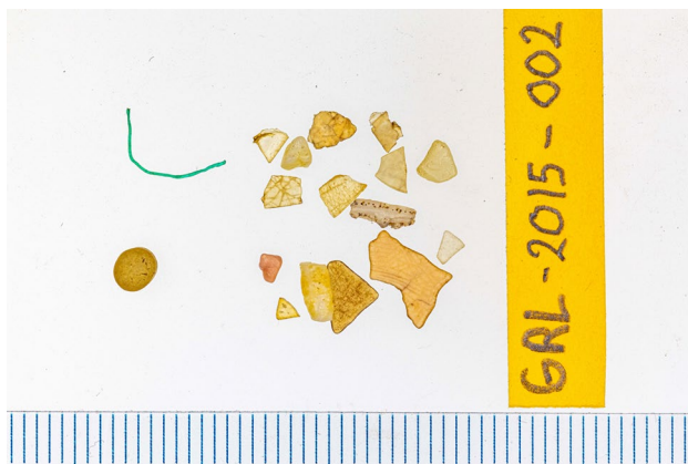
Fig. 2 Stomach content of fulmar GRL-2015-002, a double light coloured adult breeding female with plastics just under the 0.1 g used in the target definition of ecological quality or good environmental status. The stomach contained 17 plastic particles weighing 0.0911 g. According to the EcoQO, 10% of stomachs may contain more plastic than in this example; the other 90% may still have plastic in the stomach, but not more than in this example

ingested plastic, we restricted data in Table 2 to more recent studies published after year 2010 that used data from mostly well after the year 2000. Thereby we largely avoid bias from temporal change as shown for previous decades in Van Franeker and Meijboom (2002), Van Franeker et al. (2011), and Van Franeker and Law (2015). Thus, early studies are not included in the table (Bourne 1976; Baltz and Morejohn 1976; Day et al. 1985; Furness 1985; Van Franeker 1985; Moser and Lee 1992; Robards et al. 1995; Blight and Burger 1997; Van Franeker and Meijboom 2002; Van Franeker et al. 2011). Regional coverage in new publications was sufficient to replace the older sources. Not all recent sources provided