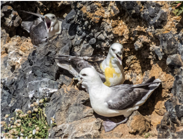
Fig. 4 The fouled fulmar on this photo had probably been spat on by its angry neighbour to the left in a dispute over the nest-site. The yellow colour of the oil indicates a fishy diet as crustacean diet usually leads to more orange colour of the oil (photo taken Iceland 3 July 2018 by Jan van Franeker)

gizzard prevents return of plastics once they have entered the gizzard (Ryan and Jackson 1986).