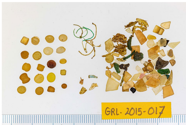
Fig. 1 Stomach content of fulmar GRL-2015-017, a coloured juvenile female that contained the highest plastic mass in our sample of 145 birds. Twenty industrial plastic pellets (left), 4 sheets (centre bottom), 8 threads (centre top) and 64 fragments (right) added up to 1.1505 g of plastic. The scale bar shows mm