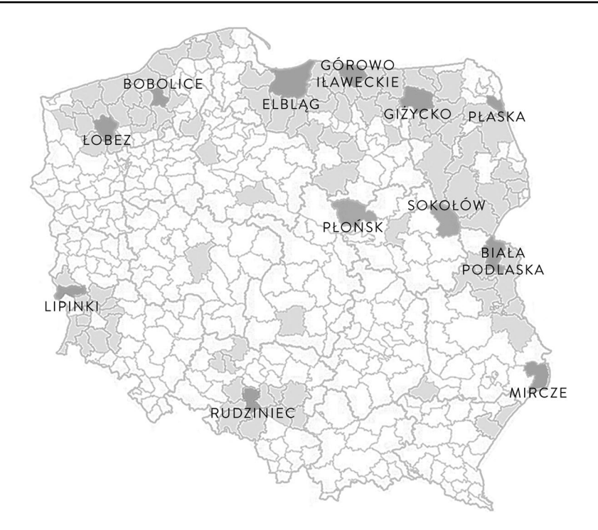
Fig. 1 Locations of study sites and main growing areas of silver birch in Poland. Dark grey areas—location of forestry districts where the study sites were established; light grey areas—forestry districts in which the area of tree stands with birch as the dominant species exceeds 1000 ha