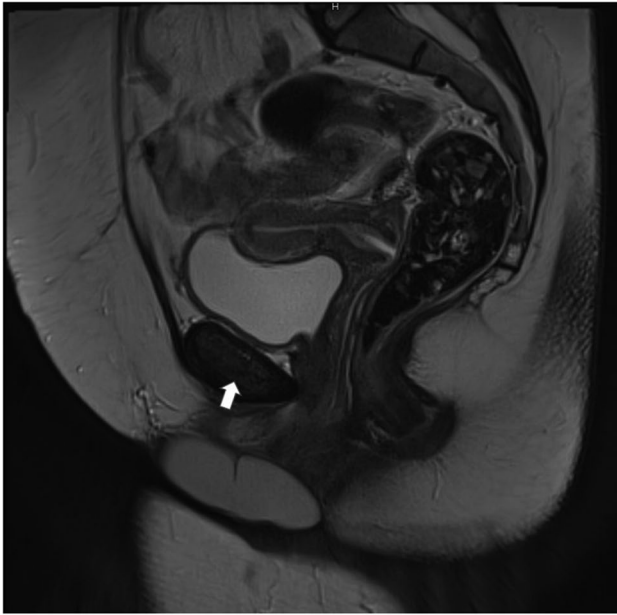
Fig. 1 MRI sagittal view of clitoral cyst