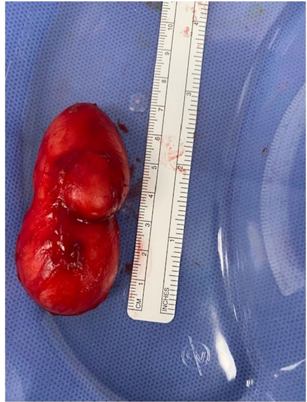
Fig. 3 Excised clitoral cyst sent for histology

Open Access This article is licensed under a Creative Commons Attribution 4.0 International License, which permits use, sharing, adaptation, distribution and reproduction in any medium or format, as long as you give appropriate credit to the original author(s) and the source, provide a link to the Creative Commons licence, and indicate if changes were made. The images or other third party material in this article are