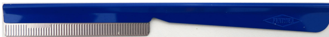
Fig. 1 Razor-type dermatome (FEATHER Disposable Dermatome, FEATHER Safety Razor Co., Ltd.)

All values were expressed using the mean \pm standard deviation (SD) and analyzed with EZR, which is a graphical user interface for R [6]. The sample size calculation based on the significant change of operative time was conducted as follows. In a previous study of total colpocleisis [1], the standard deviation of operative time was approximately 30 min. We estimated the sample size with a change of mean operative time of 25 min (effect size of 0.8), power of 0.8, significance level of 0.05 and ratio of the control group to dermatome group of 1:1.5. A sample size of 19 in the control group and 29 in the dermatome group was needed. Data distribution was assessed with the Shapiro-Wilk test for continuous variables. As a result, age and BMI were normally distributed, and Student's t -test was used for analysis. Since other continuous variables were not normally distributed, Mann-Whitney U test was used for analysis. For categorical